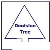
Figure 1.1 Decision Tree How to Address Suicidal Thoughts and Behaviors in Substance Abuse Treatment