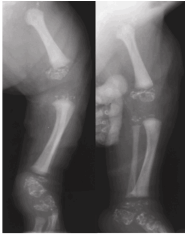
Figure 1. Radiographs from a female infant with CDPX2 demonstrating epiphyseal stippling (also called chondrodysplasia punctata; punctate epiphyseal dysplasia)

Radiograph originally published in Herman [2000]; reproduced with permission from Elsevier Ltd.