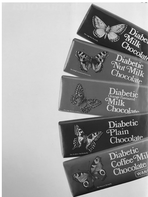
Figure 7.1 'Wander's Diabetic Chocolate'. Advertisement featured in supplement of the Chemist and Druggist (1979).

public's ideas about sugar consumption, in particular its association with obesity and henceforth the reluctance to give up artificial sweeteners as a substitute to its sweetness.