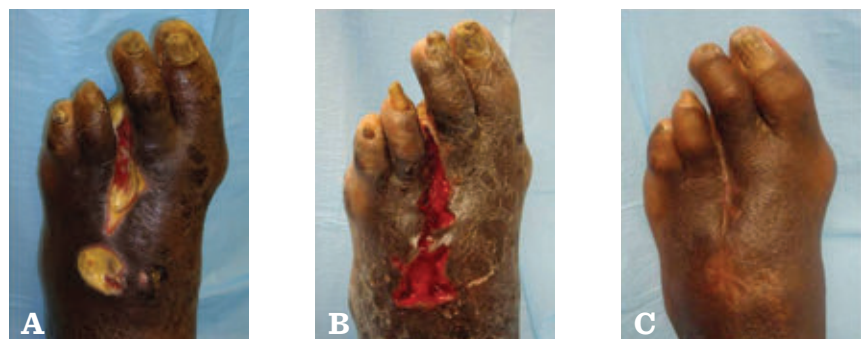
FIGURE 3 Progression of a diabetic foot ulcer from necrotic wound base (A), to surgical debridement (B), to complete healing (C).

Surgical debridement is arguably the most common and varied type of debridement (Figure 3). A myriad of instrumentation and adjuncts are used to physically excise non-viable tissue from the wound bed, either at the bedside, in the clinic, or in an operating room. The surgeon will debride tissue to viability, as determined by tissue character and the presence of vascularity in healthy tissues, using any combination of instruments, such as rongeur, curette, blade, scissors, and forceps.