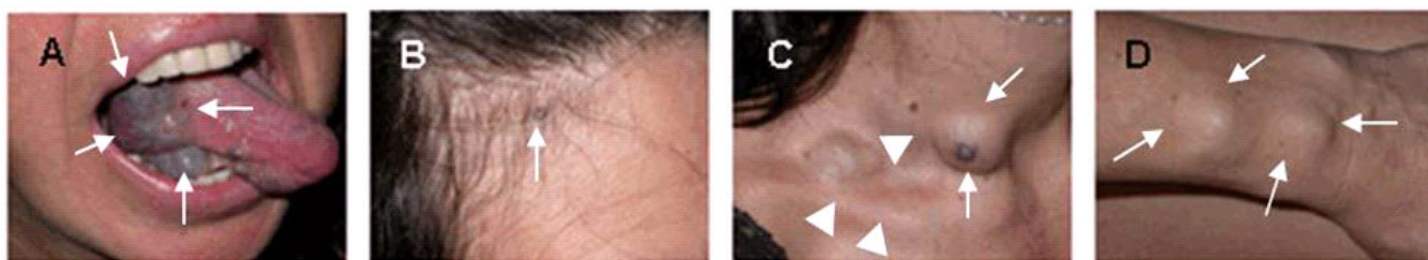
Figure 1. Multiple cutaneous and mucosal venous malformations (VMCM) (marked by arrows) in one affected individual