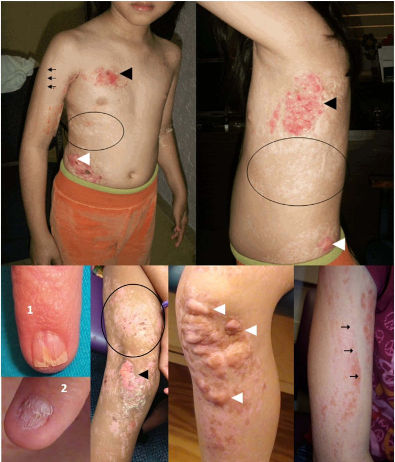
Figure 1. Ectodermal manifestations include yellowish-pink areas representing fat herniation (white arrowheads), patchy aplasia (black arrowheads), hyper- & hypopigmentation following lines of Blaschko (black arrows indicating the border), and hypopigmented areas of poikiloderma (circled regions). The nail phenotype ranges from longitudinal ridging (1) to hypoplastic (2).