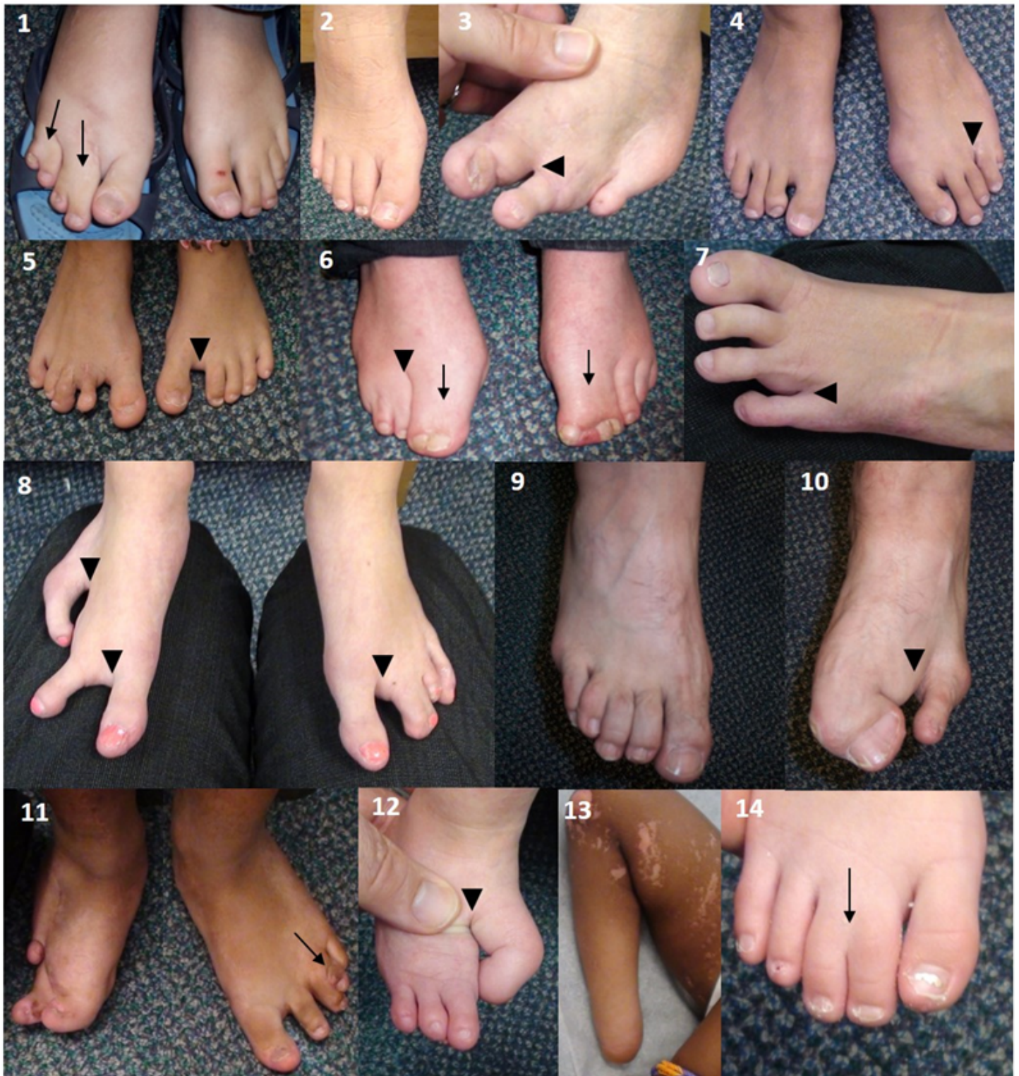
Figure 3. Highly variable limb malformations

Feet showing syndactyly (black arrows), split-foot malformation or ectrodactyly (black arrowheads), oligodactyly (3, 6, 7, 8, 10, 11, 12), and distal transverse limb defect (13)