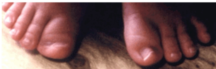
Figure 3. Broad, partially duplicated halluces

Note: (1) Since a significant proportion of CREBBP pathogenic variants are large deletions, RSTS may be diagnosed by CMA performed without prior consideration of a diagnosis of RSTS. (2) Clinical features associated with contiguous gene deletions involving CREBBP that have limited phenotypic overlap with RSTS have been reported (see Genetically Related Disorders).