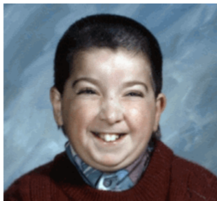
Figure 1. Typical facial appearance in individuals with RSTS. Note arched brows, downslanted palpebral fissures, low-hanging columella, and grimacing smile.