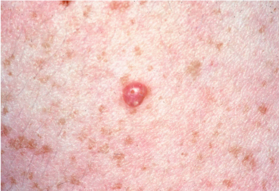
Figure 1. Trichilemmoma