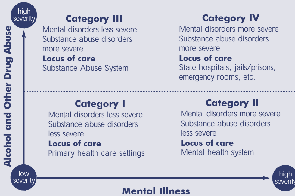
Figure 2-1 Level of Care Quadrants

Although the chapters of this TIP are not organized around the four-quadrant framework, most of the material in chapters 3 through 7 is directed primarily to addiction counselors working in quadrant III settings and other practitioners working in quadrant II settings.